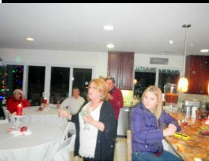
Dinner at the Gunns ranch

Thanks to one and all for a successful 2012 Christmas Party and also for a big "Toys for Tots" collection.