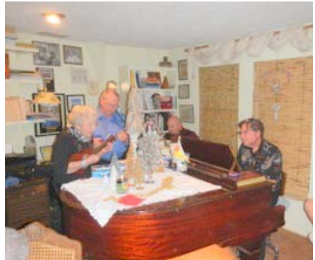
Some members sing along with the musical ensemble