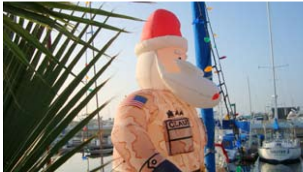
Blowup Santa on Escapade's foredeck guarded against any pirate forays

Escapade is decorated for the Parade of a Thousand Lights, Shoreline Marina, Long Beach, December 8th, 2012. 13 passengers enjoyed the parade around Shoreline and Rainbow harbors.