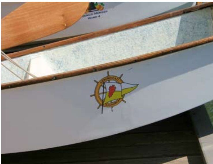
Our logo on both \sides of Sabot #6 will be seen every time the boat is used throughout the year