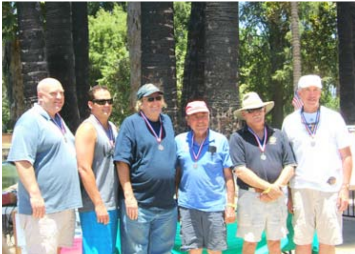
6 of the 7 skippers, representing various donors

This community fund raising event was held at Lake Evans in Fairmount Park, Riverside.