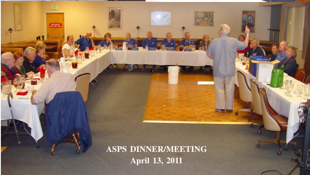
ASPS DINNER/MEETING April 13, 2011