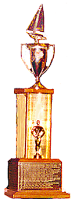
Duncan Gleason award - D13 best squadron newsletter 2003, 2004,2006, tied 2007, 2008,2009